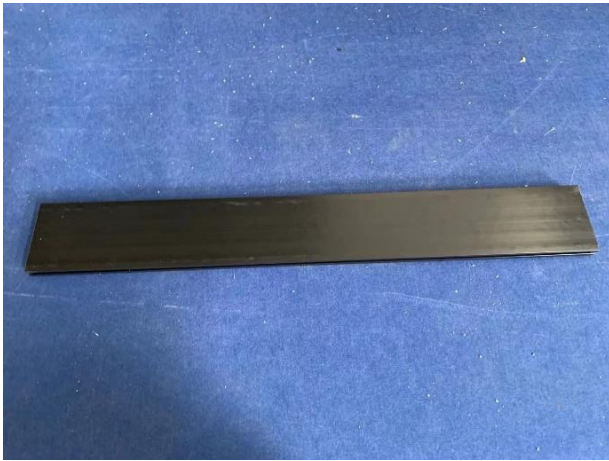
Front view (test side)